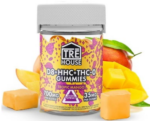
eFigure 1. Images of Example Delta-8-THC Products and Marketing